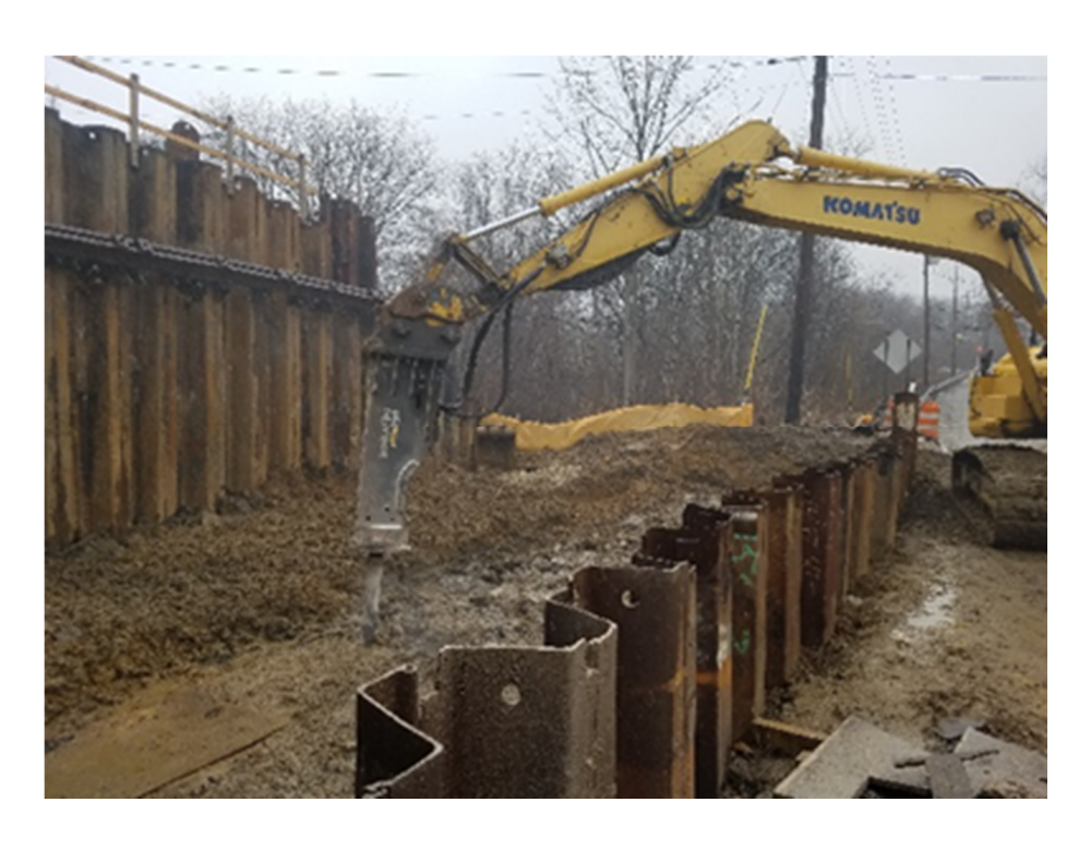
Figure 1 RE Pierson Demolishing North Abutment Footing

Borough of Audubon County of Camden, New Jersey Weekly Progress Report Monday 01/29/2018 thru Friday 02/02/2018