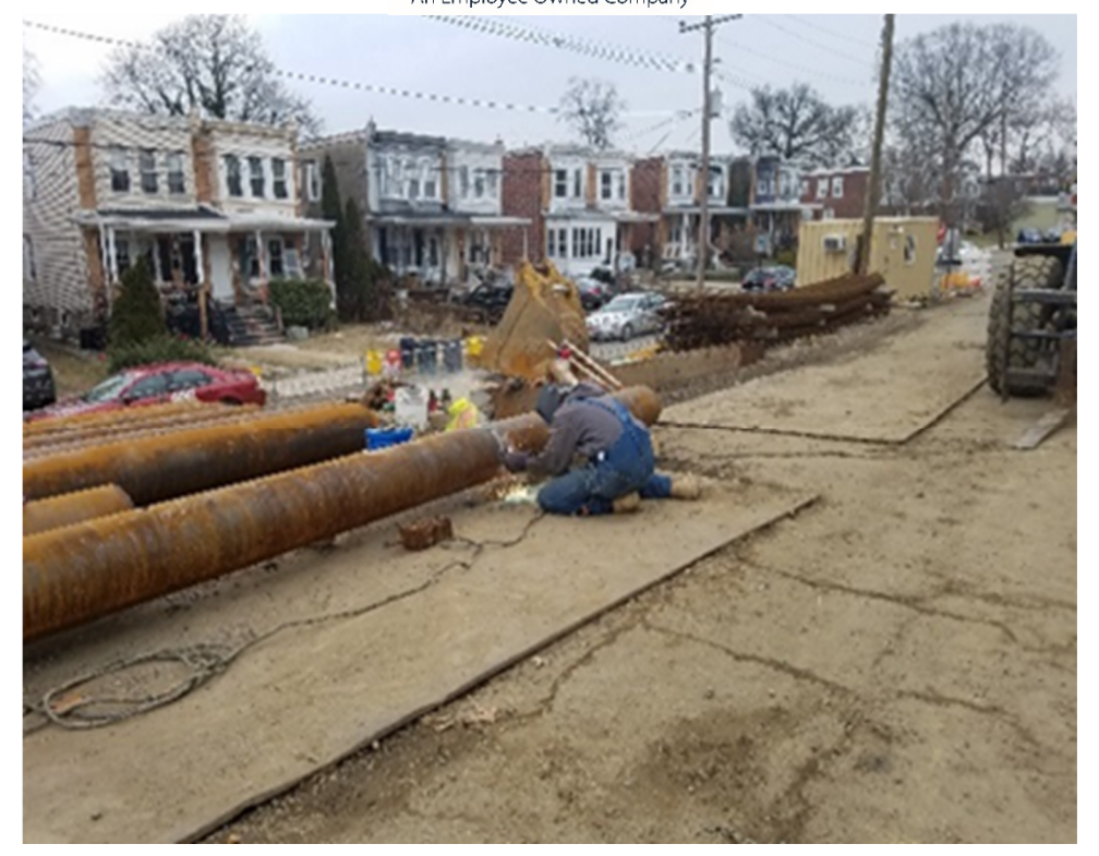
Figure 3 PE Pierson Welding Test Piles