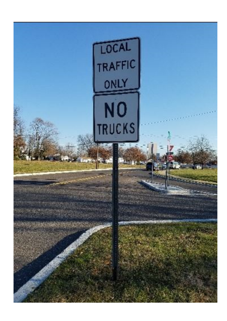
Figure 2 Additional signage installed on Kennedy Boulevard