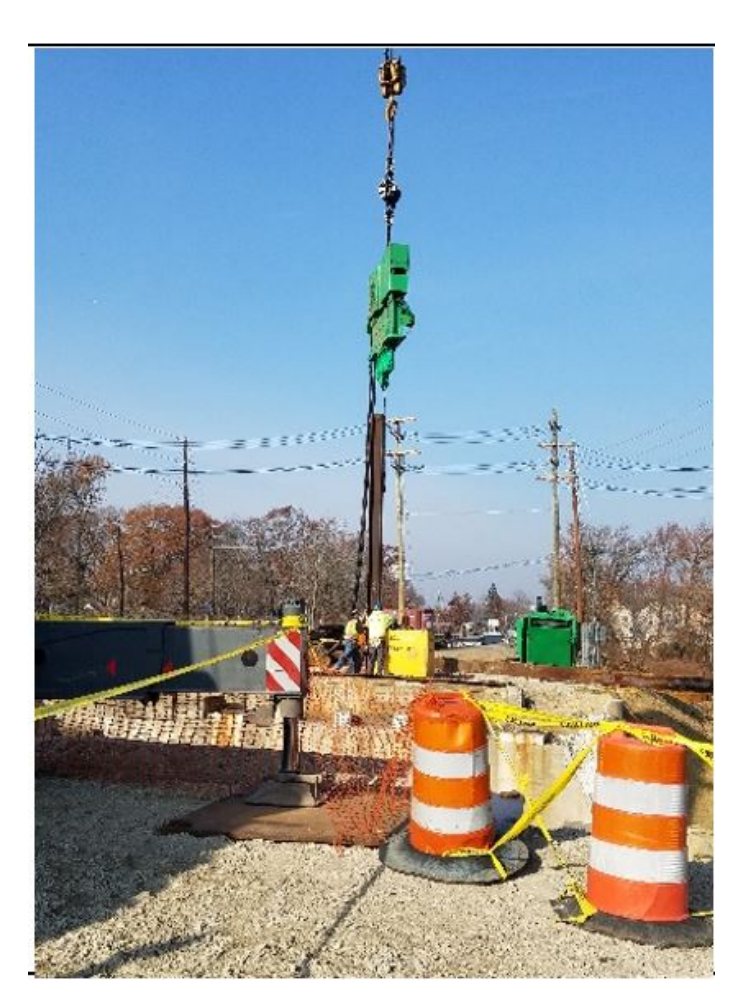
Figure 1 Driving H-Pile for Temporary Sheeting Template (North Side)

Borough of Audubon County of Camden, New Jersey Weekly Progress Report Monday 12/04/2017 thru Friday 12/08/2017