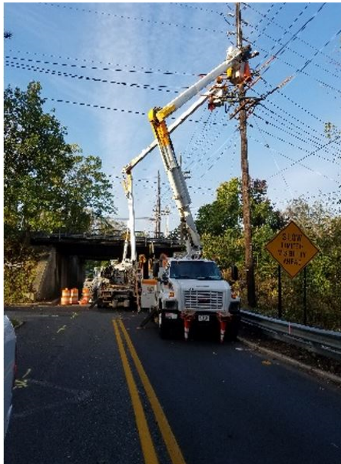
Figure 1 PSE&G transferring wires to new poles

Borough of Audubon County of Camden, New Jersey Weekly Progress Report Sunday 10/22/2017 thru Friday 10/27/2017