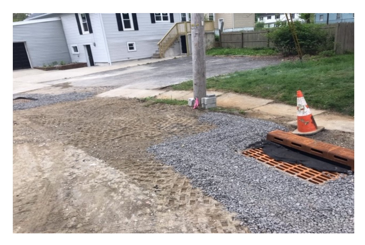
Figure: 3 – Utility structure rebuild near W.park Ave on lake Blvd (Looking East South side).