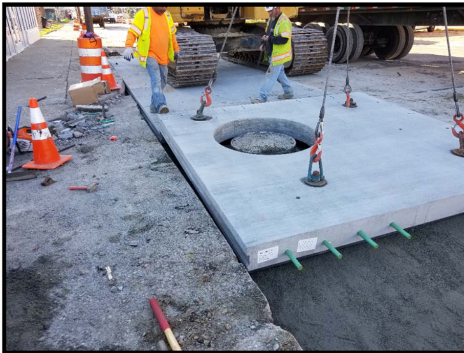
Slab #K38 being lowered into place around reset manhole casting.