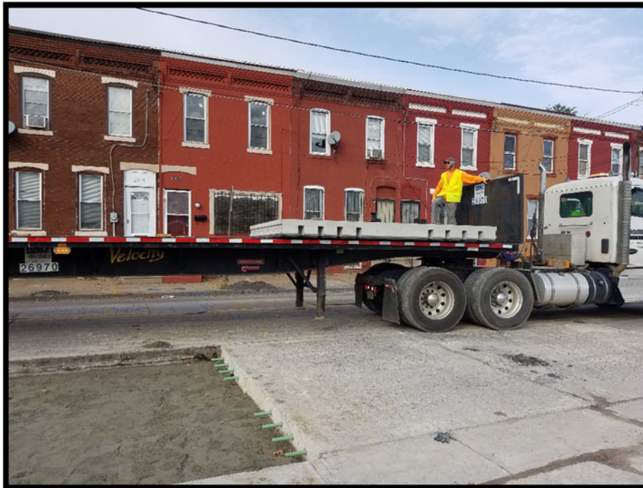
Subbase prepared, dowels installed, ready for precast slab to be installed