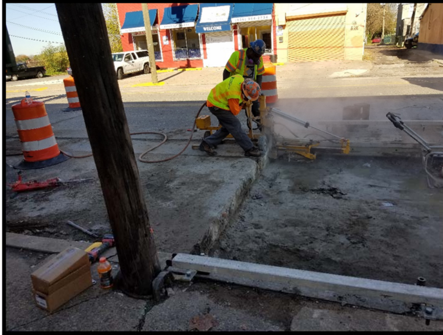
Drilling dowel holes in existing slab scheduled to remain in place.