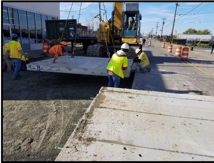
New precast reinforced concrete slab being lowered into place.