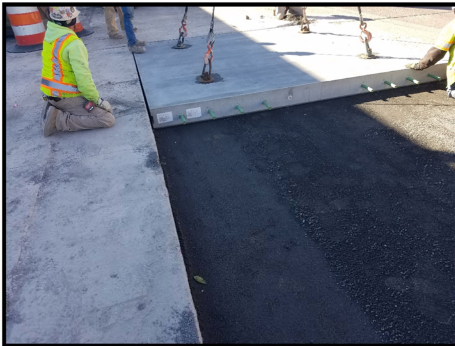
New precast reinforced concrete slab being lowered into place.