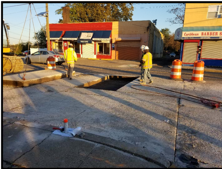
Existing slab removed.