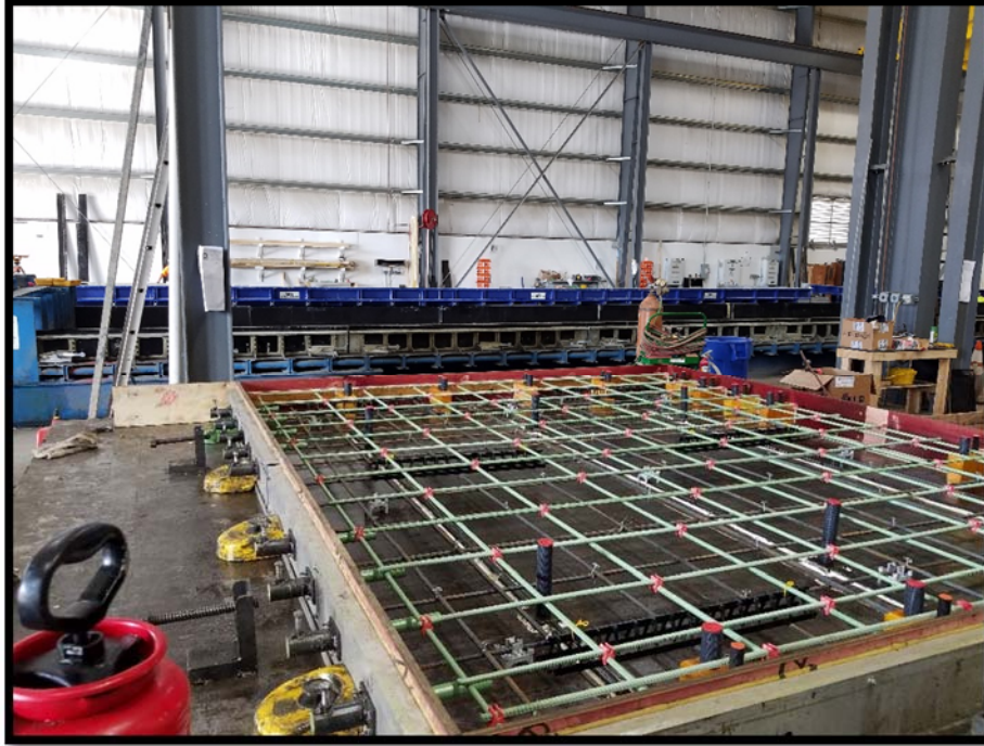
Precast slab ready for concrete pour in Vineland, NJ