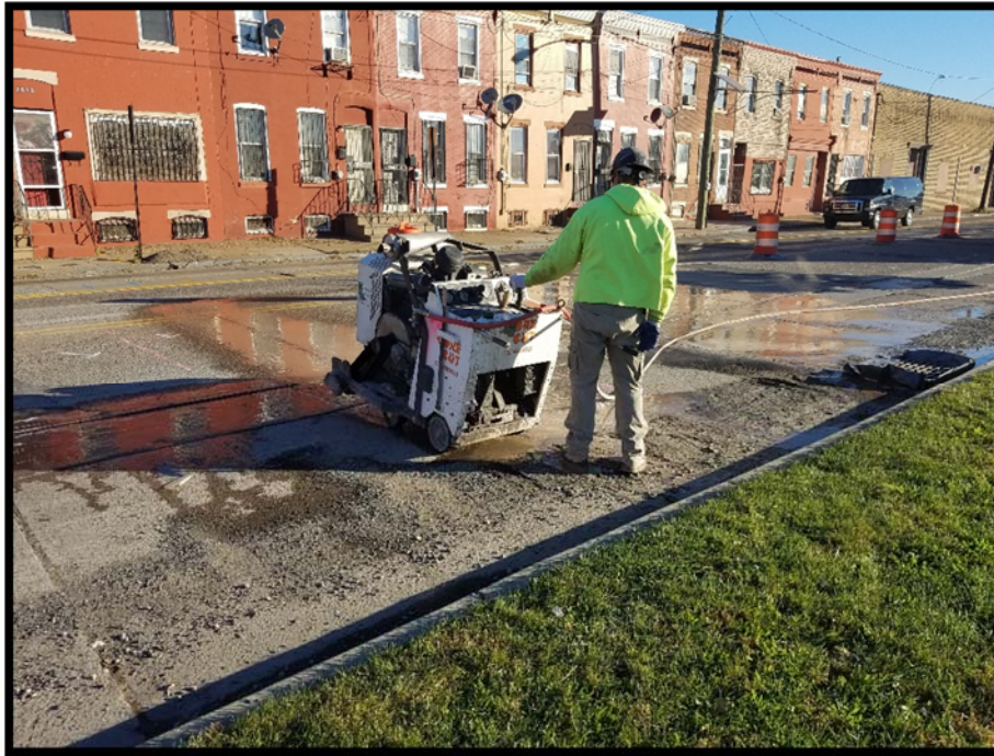
Sawcutting existing slabs prior to removal.