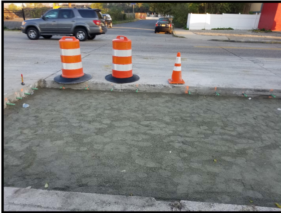
Subbase prepared, dowels installed, ready for precast slab to be installed.