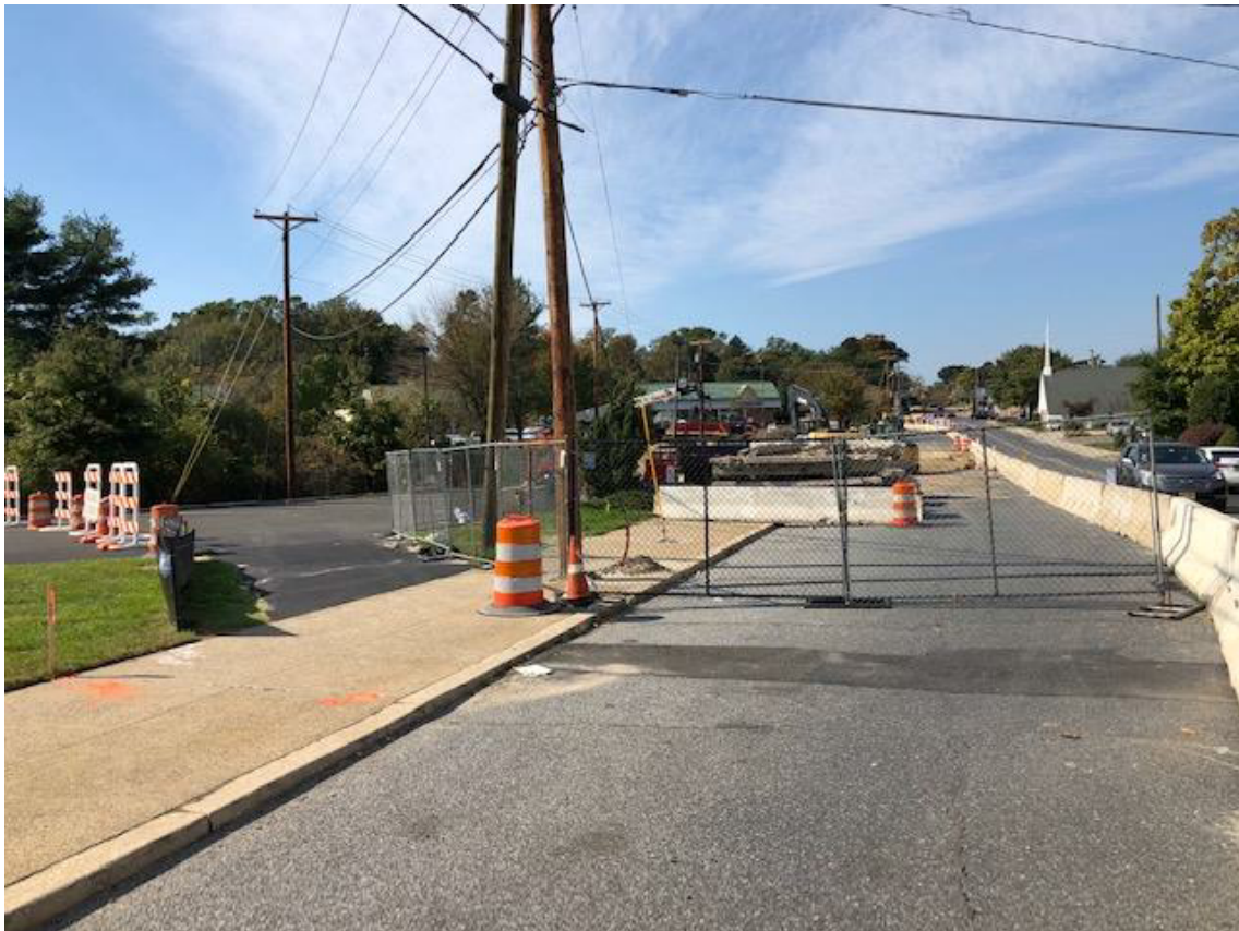
Contractor installed fence to keep pedestrians on the newly constructed walkway and out of the bridge demo work zone

Borough of Clementon County of Camden, NJ Weekly Progress Report #9 October 22 to October 26, 2018