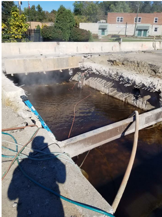
Superstructure has been removed