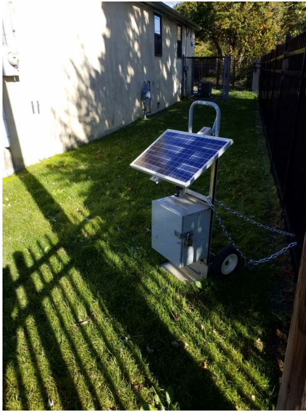
Seismograph monitoring the Senior Center during Construction Activities