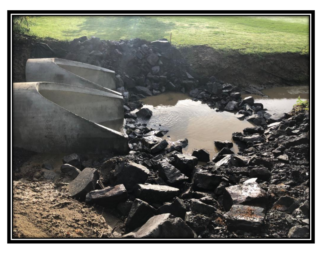
Figure: 2 – Installation of twin 48" concrete flared end sections with rip rap scour hole at the outfall of the twin 48" RCP culvert

Hampton Road (CR 623) Roadway Improvement Project Township of Cherry Hill, Camden County, New Jersey 4/29/19 to 5/3/19 - Weekly Progress Report #6