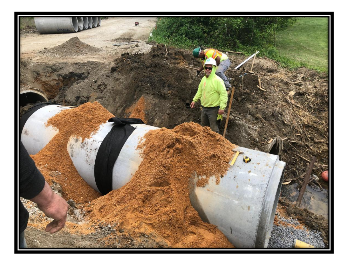
Figure: 1 – Installation of 48" RCP at the culvert replacement adjacent to the Merchantville Country Club

WEEKLY PROGRESS REPORT #6 April 29, 2019 to May 3, 2019