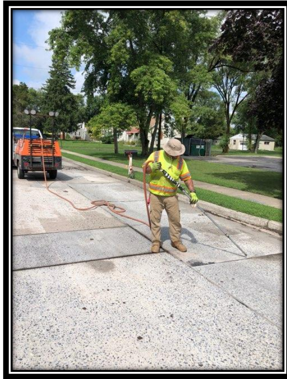
Figure: 2 – Cleaning of existing joints in preparation for sealant installation