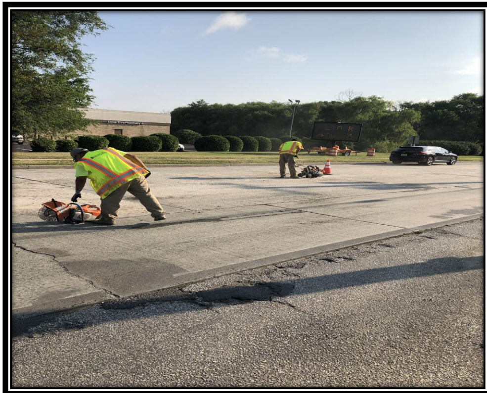
Figure: 1 – Sawcutting of existing joints in preparation for sealant installation in the northbound lane at the intersection with Erial New Brooklyn Road