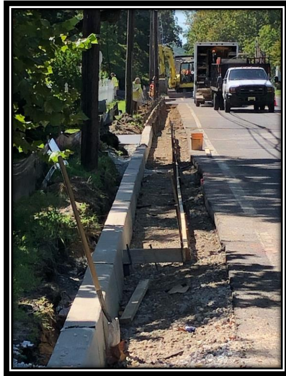
Figure: 2 – APS concrete crew setting forms for gutters by drilling dowels into concrete vertical curb and pouring concrete.