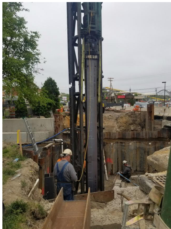
Last test pile