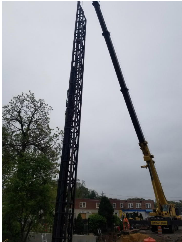
Test pile driven