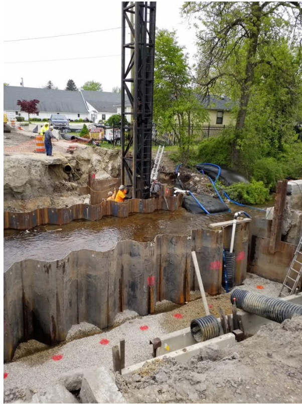
One test pile on each side of North Branch