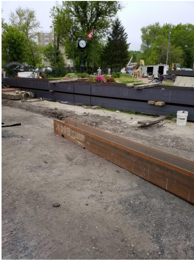
Test piles marked out prior to installation