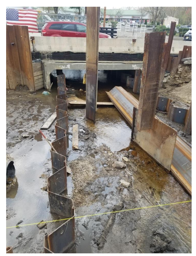
North East sheeting installed