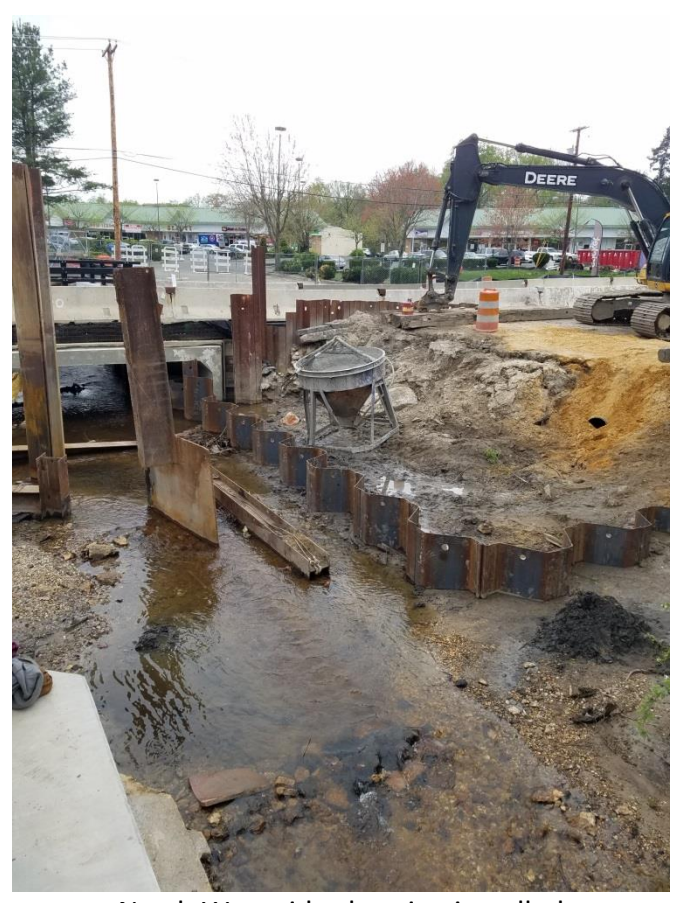
North West side sheeting installed

Borough of Clementon County of Camden, NJ Weekly Progress Report #27 April 22 to April 26, 2019