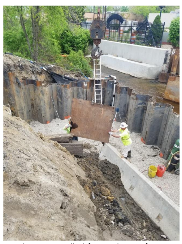
Shoring installed for workers safety