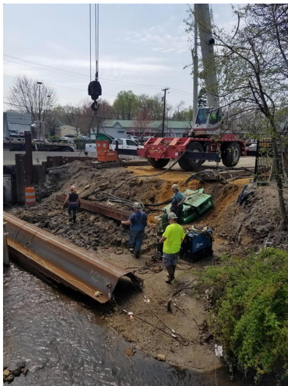
Preparing to install sheets on the North West side