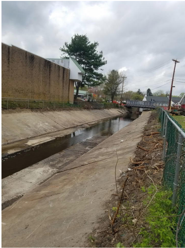
Waterway looking towards Clementon – Berlin Road