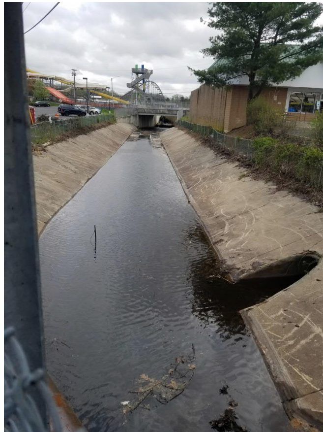
Waterway looking better

Borough of Clementon County of Camden, NJ Weekly Progress Report #26 April 15 to April 19, 2019