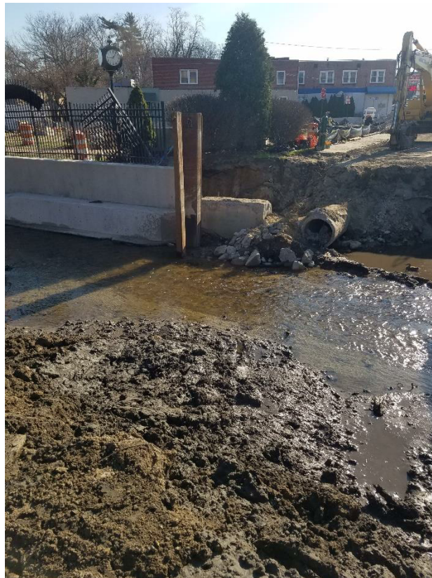
Looking east toward the park from the west side of the existing structure