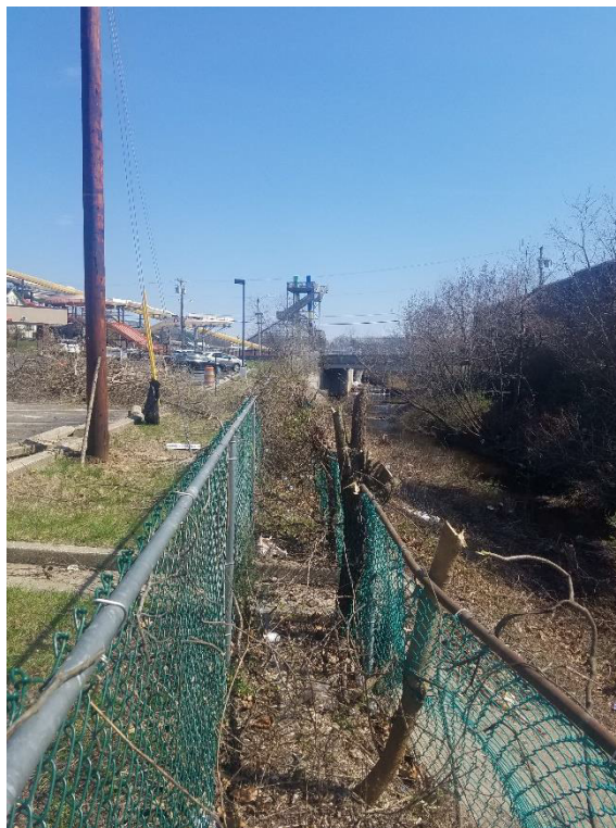
Another fence was found once vegetation was removed looking east as you can see Clementon Park in the background