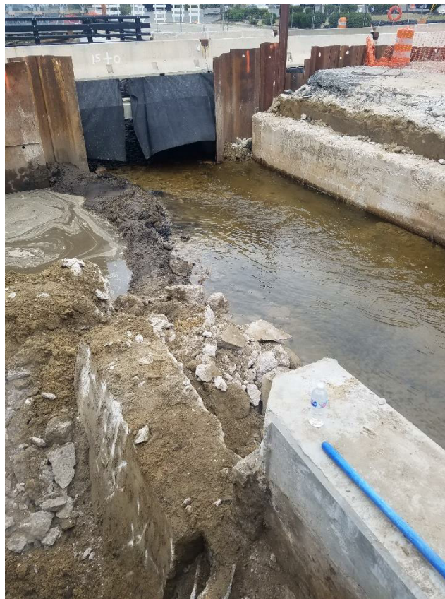
Demo continues. East abutment wall failed once superstructure was removed