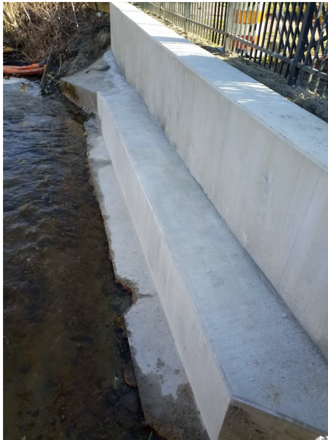
Finished retaining wall looking north from the existing structure

Borough of Clementon County of Camden, NJ Weekly Progress Report #24 March 25 to April 8, 2019