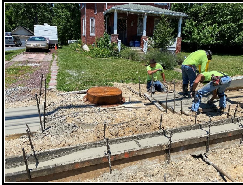
Figure 2: Continue Sidewalk on Park Avenue.

Department of Public Works Charles J. DePalma Complex 2311 Egg Harbor Road Lindenwold, NJ 08021 Phone: (856) 566.2980 Fax: (856) 566.2987 highway@camdencounty.com CamdenCounty.com