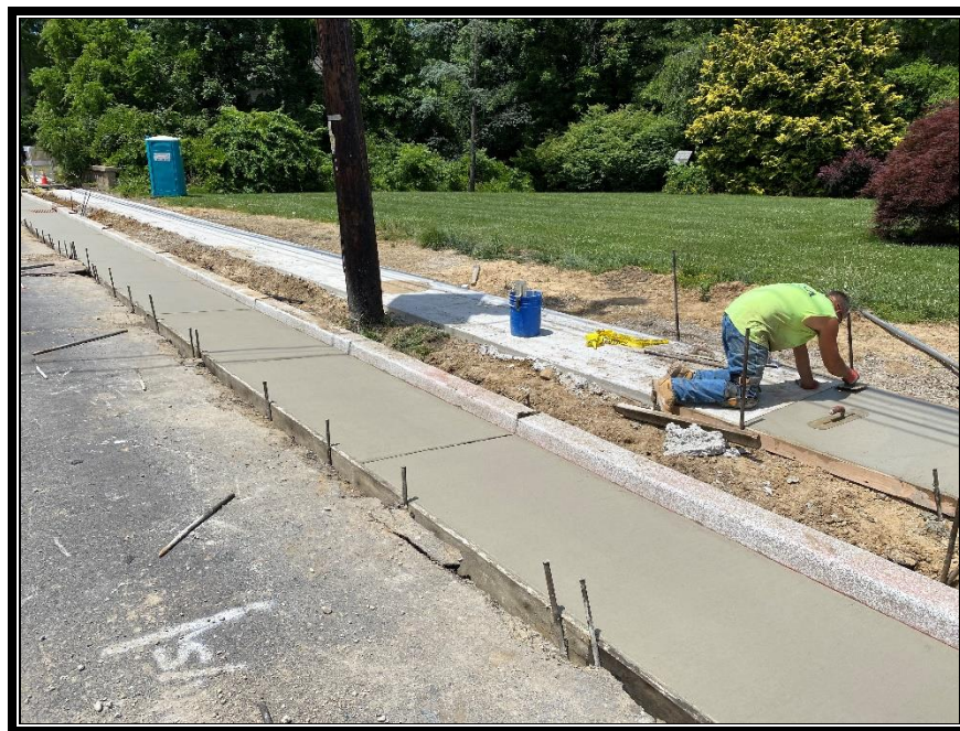
Figure 3: Completed form work for concrete sidewalk and gutter line.