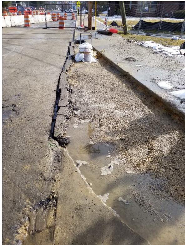
Last part of roadway the was worked on to allow for traffic shift