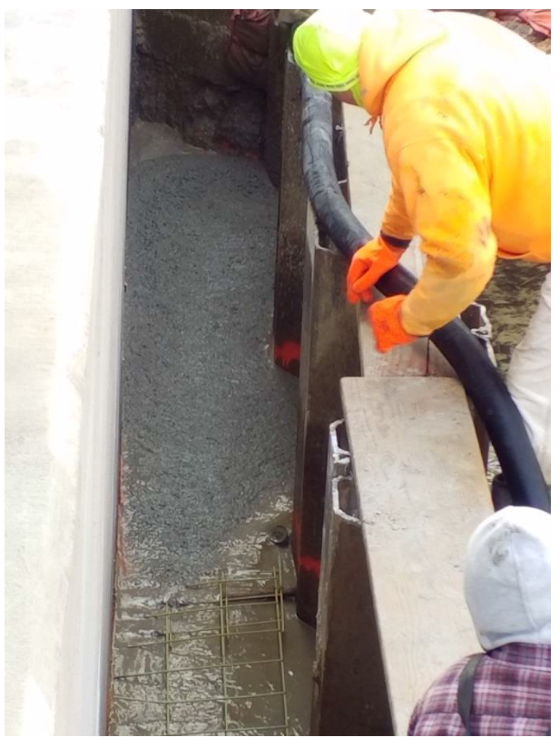
Pumping concrete where wire mess was installed