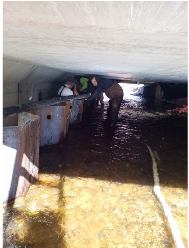
Concrete was both under the culvert and in front of the 2-wingwalls