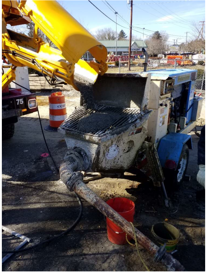
Contractor using a portable concrete pump to pour concrete between culvert and steel sheets

Borough of Clementon County of Camden, NJ Weekly Progress Report #20 February 18 to February 22, 2019