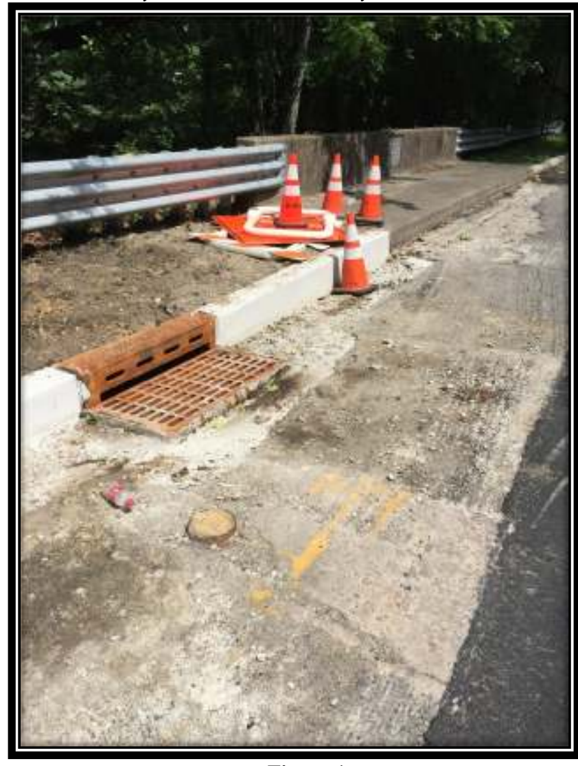
Figure 1 New Curb and ECO Type B Casting

Monday June 18, 2018 to Friday June 22, 2018