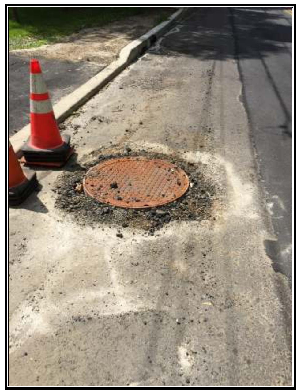
Figure 2 New Reset Manhole Casting