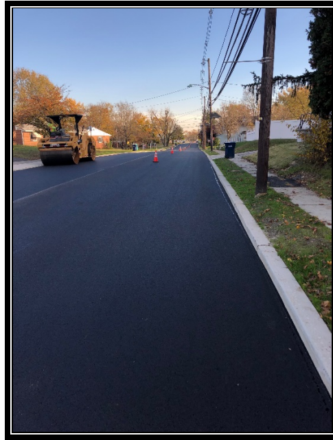
Figure 4: Completed pavement of Warwick Road.