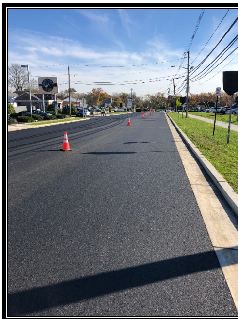
Figure 3: Completed pavement surface of Warwick Road in front of the Highschool.