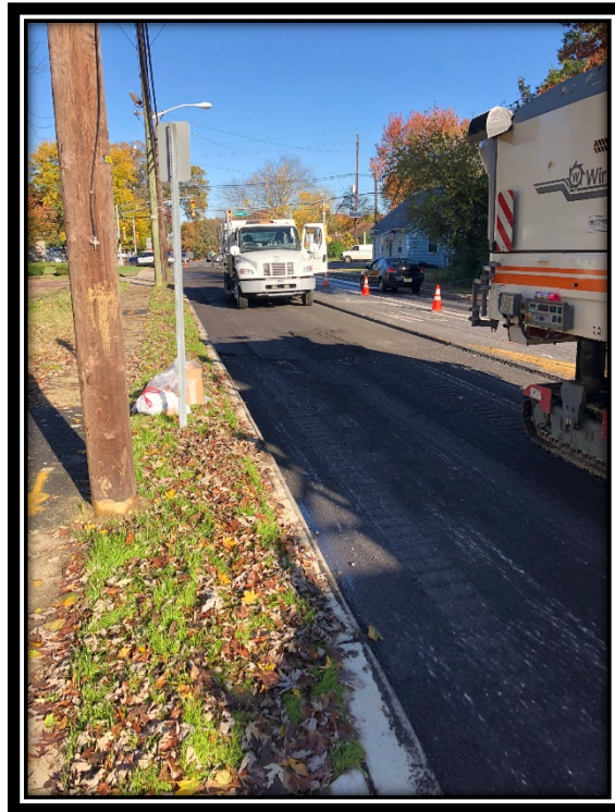
Figure 1: Final milling of the project.

Monday, November 5, 2018 to Friday, November 30, 2018