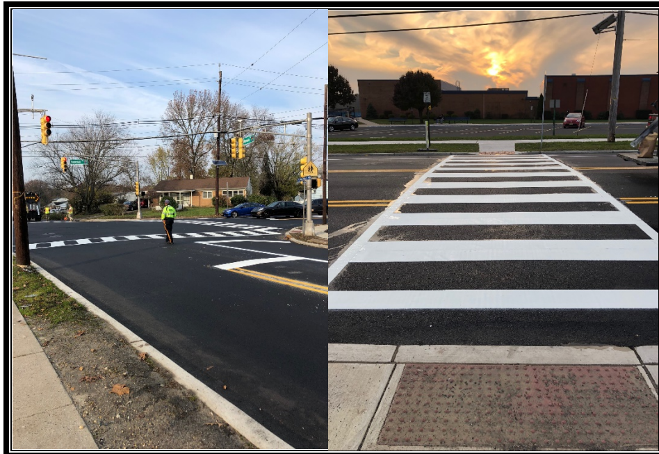
Figure 5: Final striping of Warwick Road.