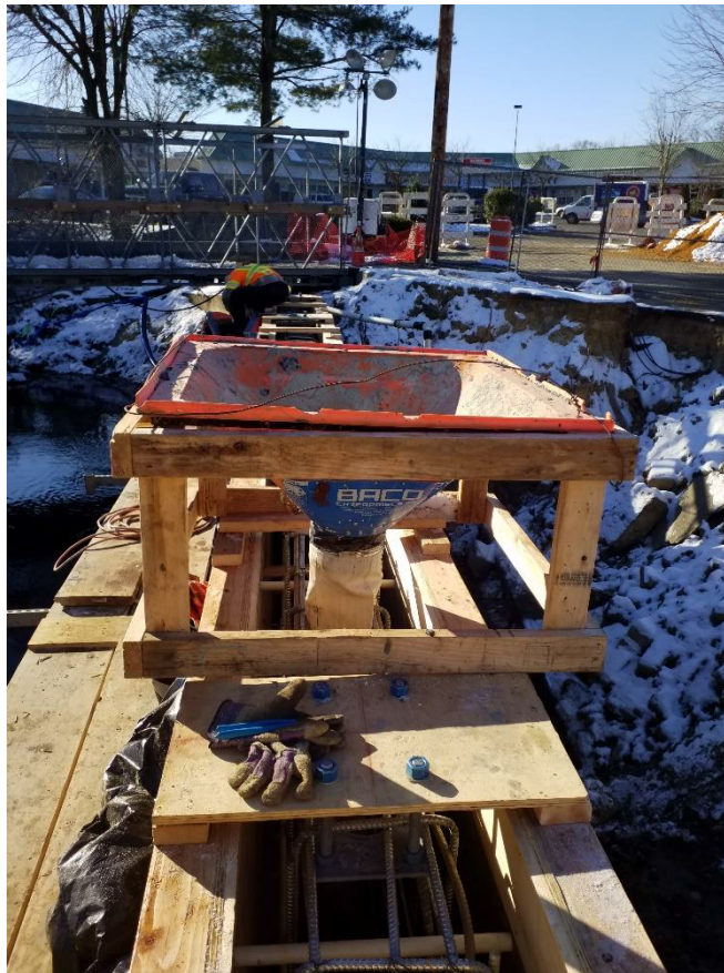
Contractor using hopper and shoot due to height of Wing wall. This was on the west side of structure.

Borough of Clementon County of Camden, NJ Weekly Progress Report #15 January 14 to January 18, 2019