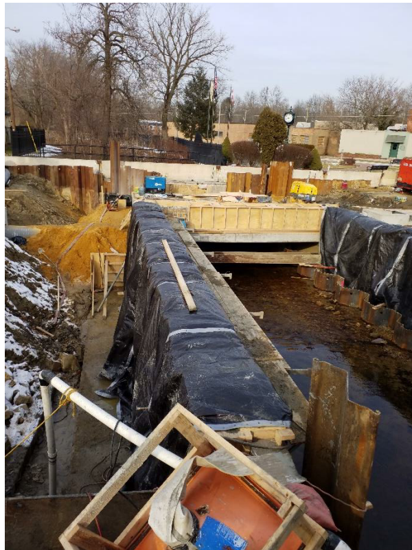
Contractor is using blankets and heater to comply with winter concrete requirements