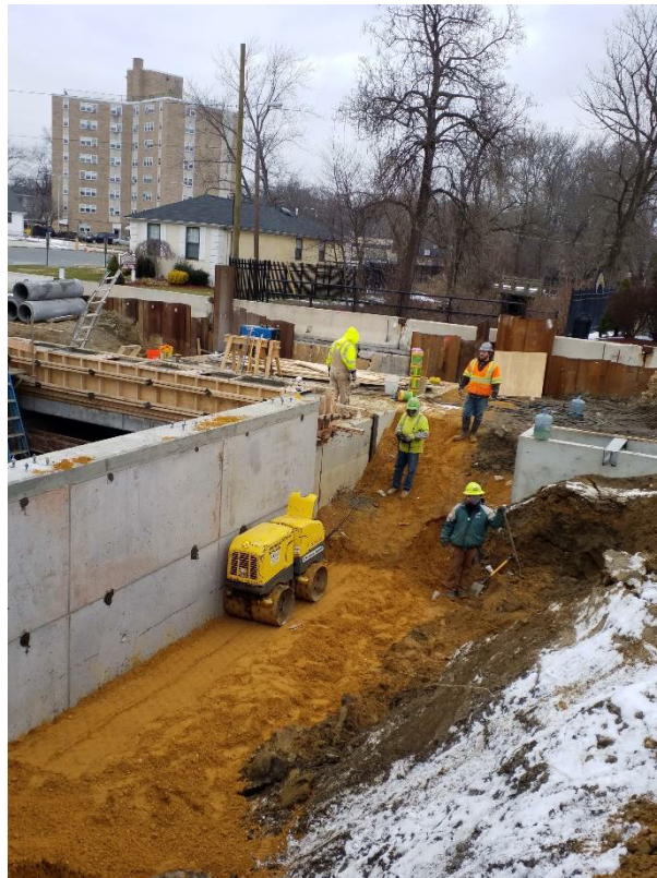
I-9 is being placed in lifts and compacted