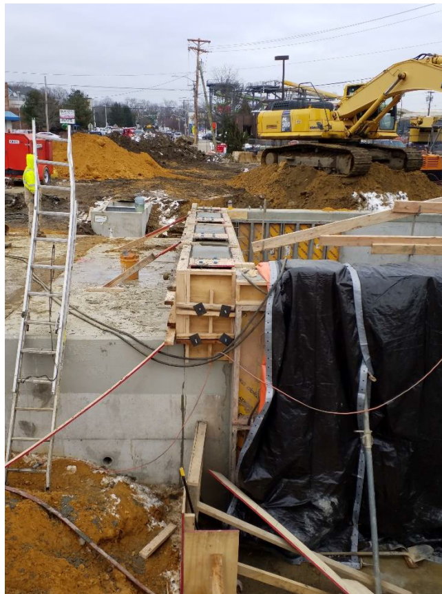
Parapet was poured on Wednesday with the anchor bolts for the railing. Railing was delivered to project also on Wednesday