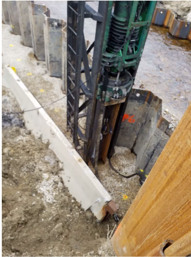
Driving H piles. All piles have been driven in Stage 2 B of project