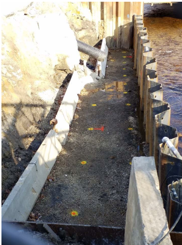
Pile layout on west side of structure