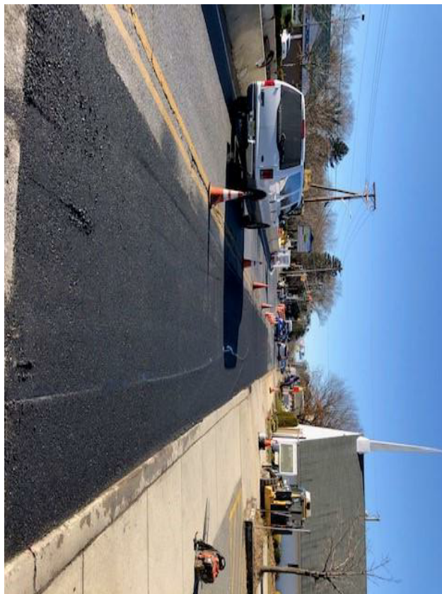
Damage roadway traveling WB was repaired.