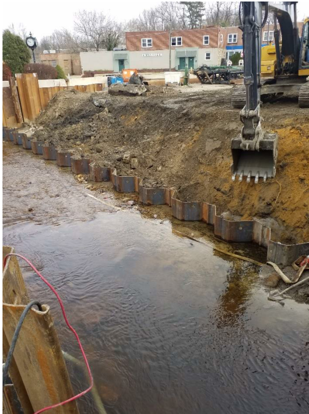
Excavating area behind steel sheets to allow for construction of piles and footing