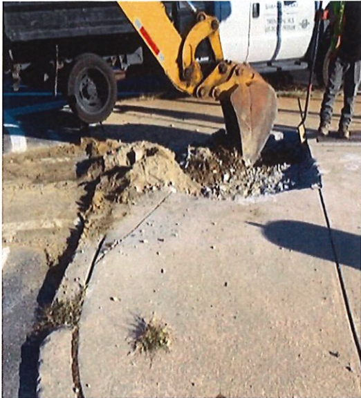
Figure 2: Excavating for pedestal foundation