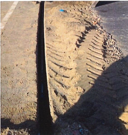
Figure 4: Roadway trench