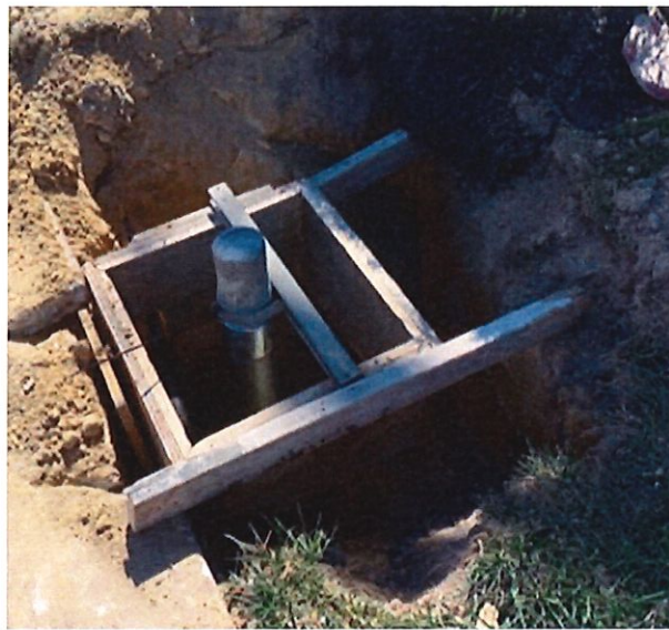
Figure 1: Pedestal formwork