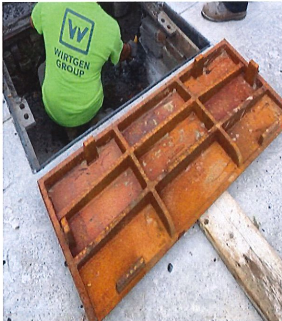
Figure 4: Reconstruction of B inlet