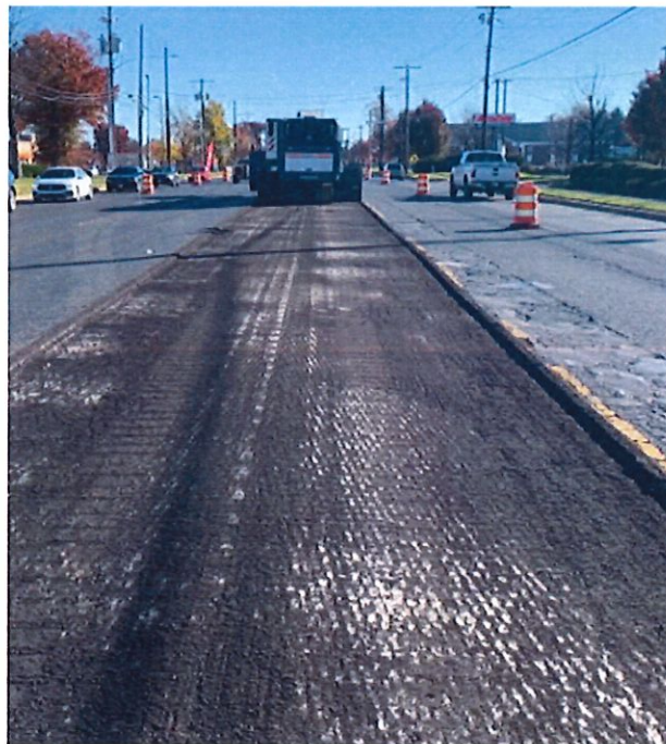
Figure 1: Milled surface