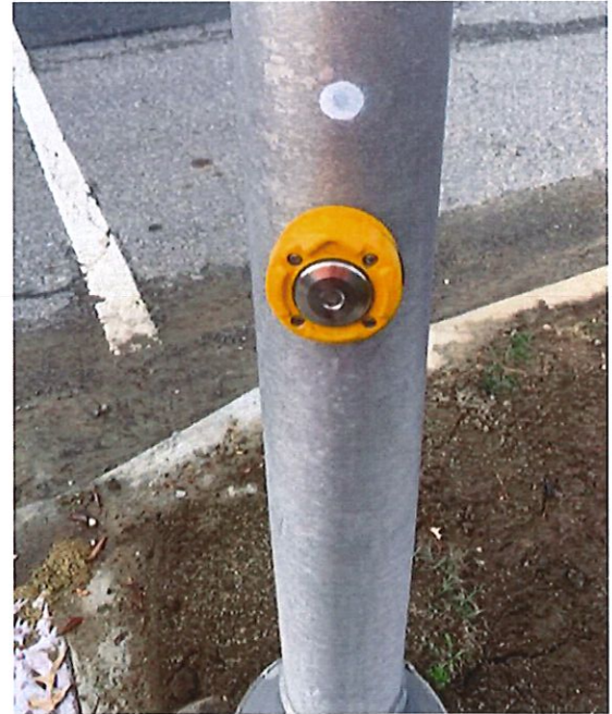
Figure 5: New push button installed