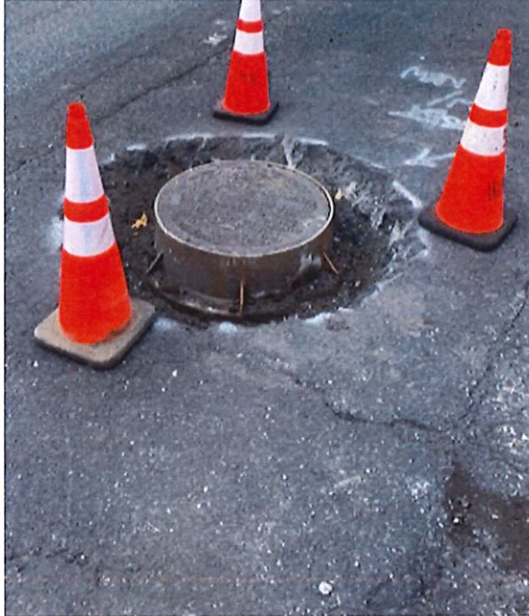
Figure 2: Casting reset