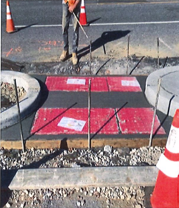
Figure 2: Curb ramps