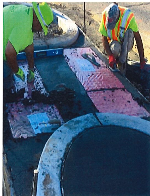
Figure 5: Detectable warning surfaces