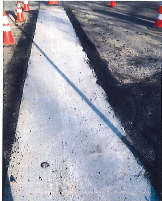
Figure 3: Trench Restoration