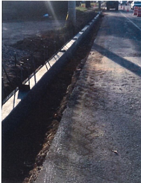
Figure 1: Curb Installation