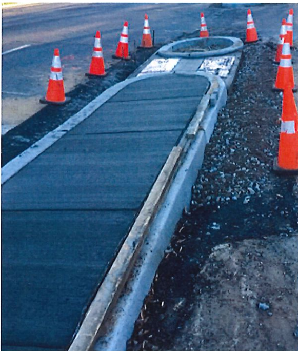
Figure 4: Concrete sidewalk placement