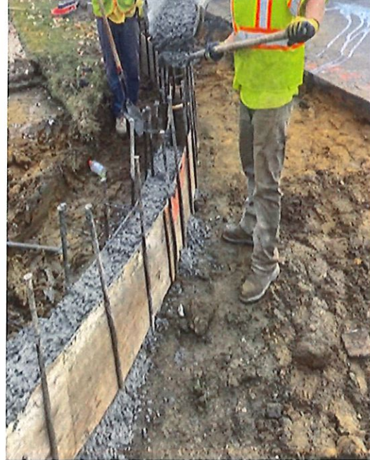
Figure 3: Concrete curb placement