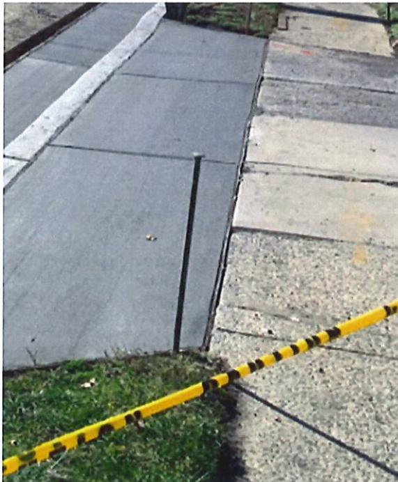
Figure 4: Concrete curb and apron completed