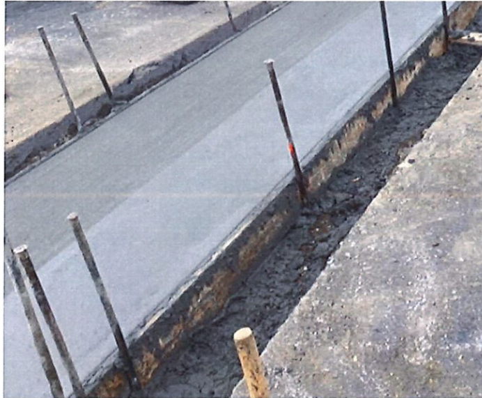
Figure 1: 8 Inch Gutter