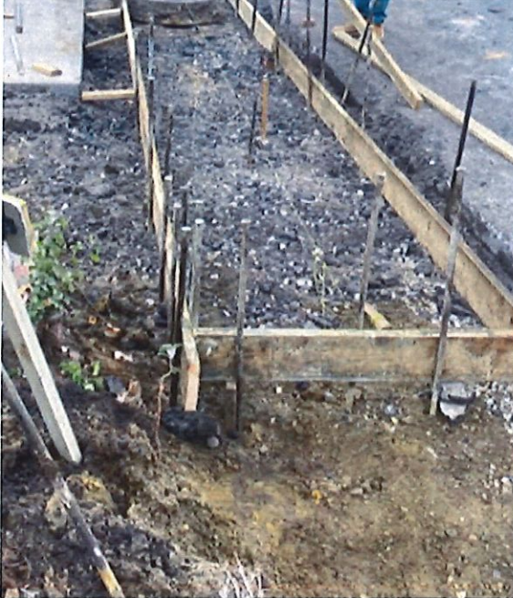
Figure 2: Forms for gutter placement