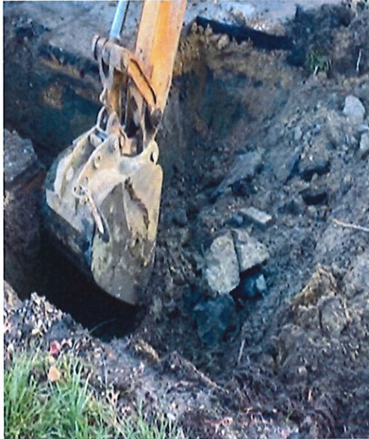
Figure 2: Excavation for Inlet