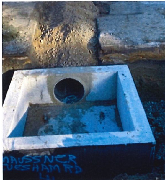
Figure 4: Inlet installation and backfill