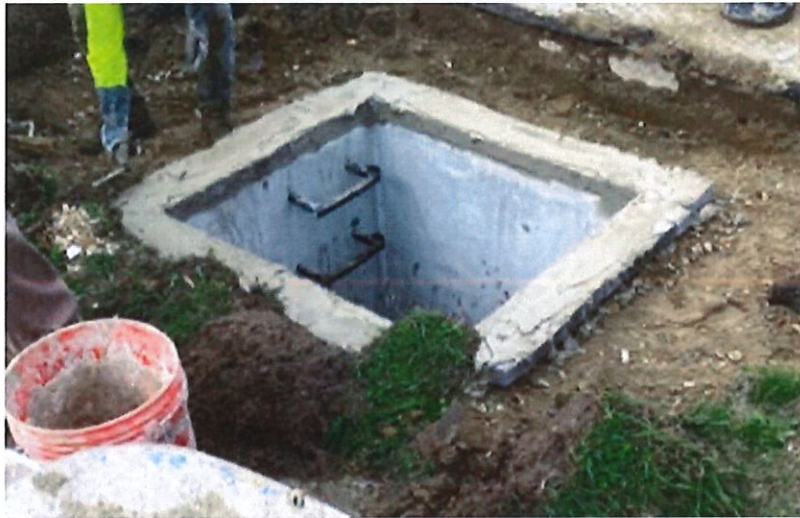
Figure 1: Inlet installed