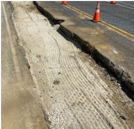
Figure 4: Compacted DGA