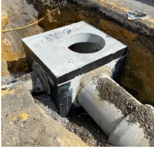
Figure 2: Set manhole with pipe