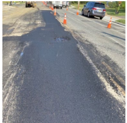
Figure 5: Temporary asphalt