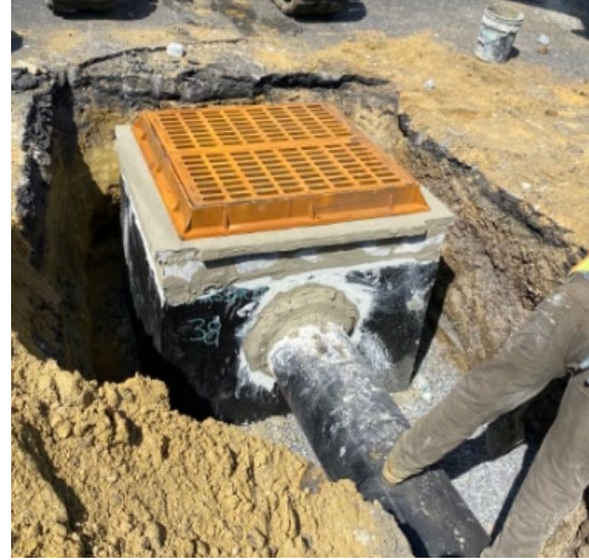
Figure 3: E Inlet