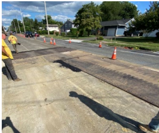
Figure 1: Asphalt finish