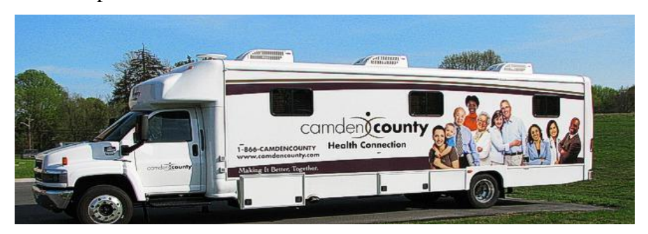
The "Camden County Health Connection" mobile health unit

Support groups such as the Chronic Disease Self Management Program, tobacco treatment and counseling, health seminars and skills-building workshops are also conducted upon request.