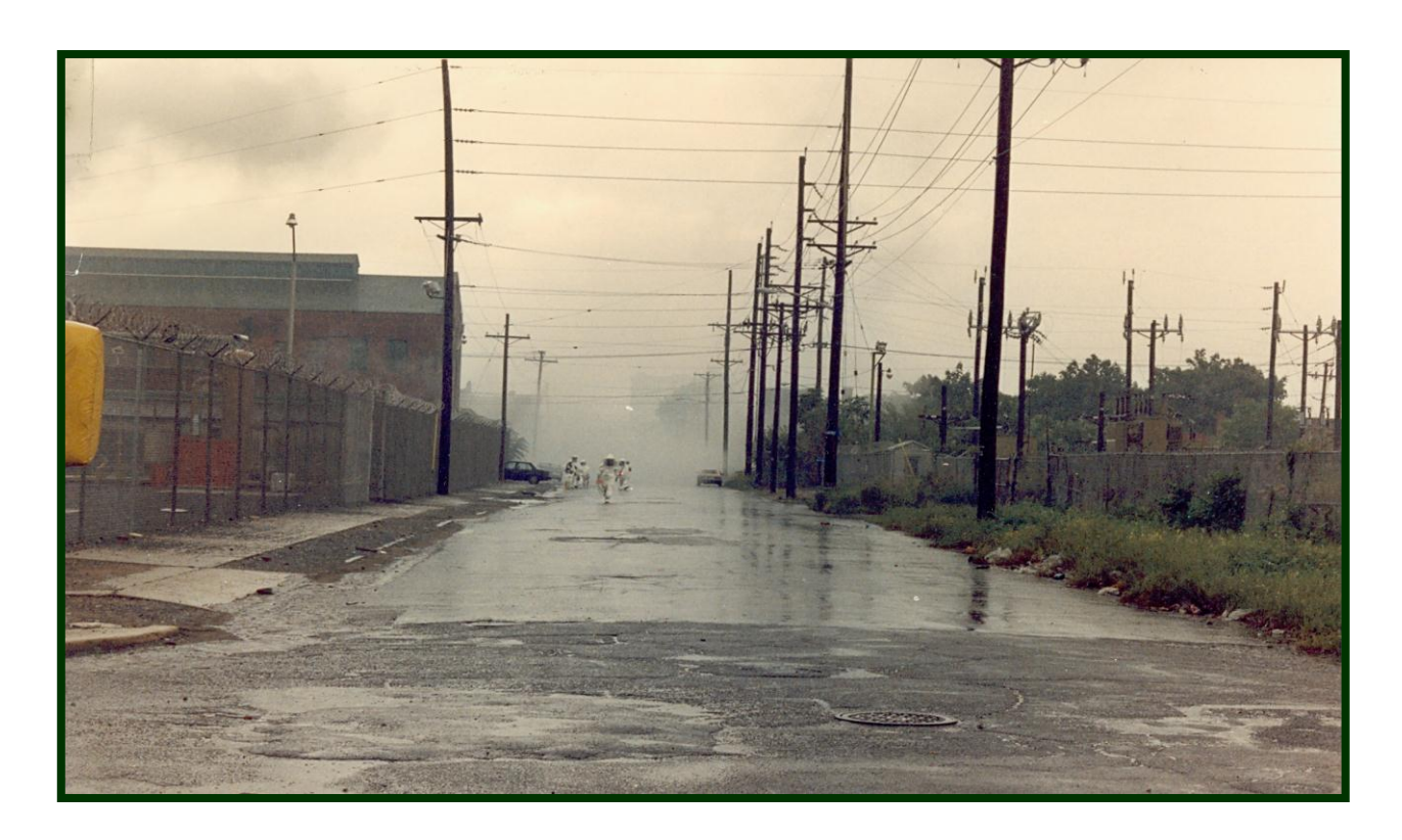
Response to a Plastic Chemical Fire in Camden County