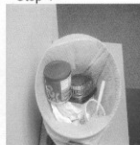
Hide in the trash

Do NOT dispose of medication down the drain or toilet.