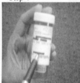
Mark out personal information