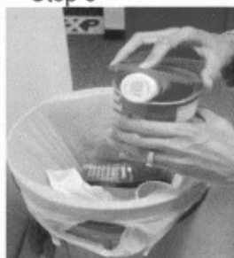
Place in opaque container